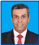
Dr. Khaled Al-Fadhel Minister of Oil, Kuwait/Minister of Electricity and Water, Kuwait